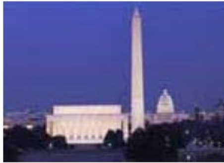
The Washington Monument

The purpose of these pseudo Corporate Courts are only to settle contract disputes and since George Washington's government was military in structure. If either party refuses to participate, these Courts cannot become involved and the dispute is dead in the water! My use of the term "dead in the water" is not a canard because these pseudo Courts are unconstitutional Courts of Admiralty, the International Law of the Sea!