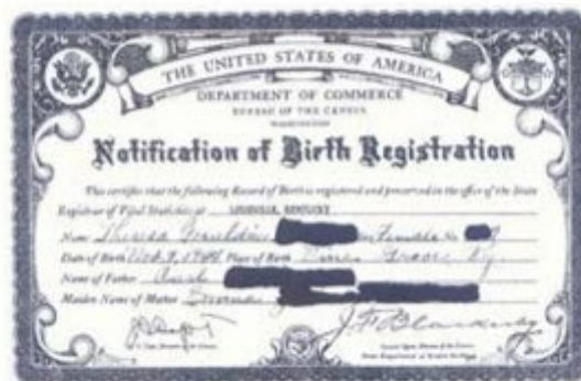
Note: issued by the Dept of Commerce

The Criminal Process usually begins with a Police Officer issuing a Citation [or] making an arrest with or without a Warrant [or] the Police Officer [or] County Attorney prepares a complaint based upon a sworn affidavit or an information, which is presented to a Judge and a Warrant is then issued. The defendant is subsequently arrested and is brought before a Judge for arraignment.